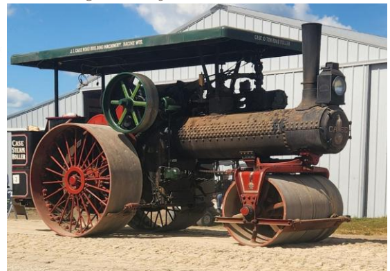
This Case Steam Roller is one of three still in existence. The only one in Canada will appear at Pioneer Acres at the Alberta's Steam Heritage Festival.